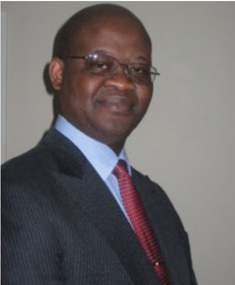
Okezie I Aruoma (USA)

Talk Title: Nutrition, Genomics and Human Health: A Complex mechanism for Wellness