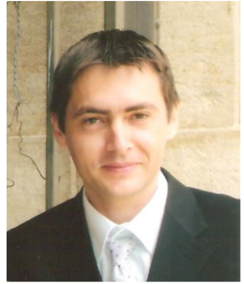
E Bourdon, Réunion (France)

Talk Title: Oxidative Stress in type 2 diabetes – Focus on the Role of AGEs