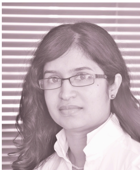
A B-Luximon (Mauritius)

Talk Title: Nano-drug formulations and combinations with bioactive compounds/phytochemicals